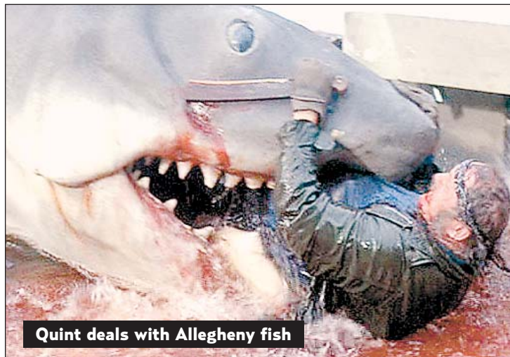
Quint deals with Allegheny fish

Captain Quint agreed to assume command of the fleet on condition that all the River Rescue vessels be scrapped in favor of his seasoned boat, The Orca , and that the entire crew be fired. "There are too many captains on this island," he explained.